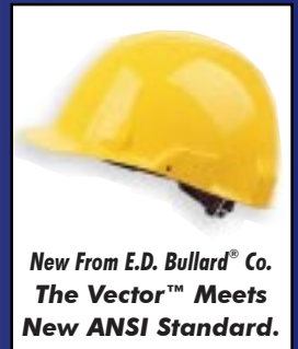
New From E.D. Bullard® Co. The Vector™ Meets New ANSI Standard.